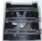
Axial Fan with Heaters