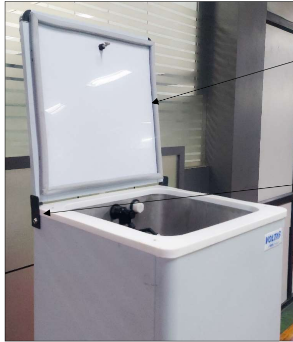
GASKET AVIALBLE IN TOP PANEL