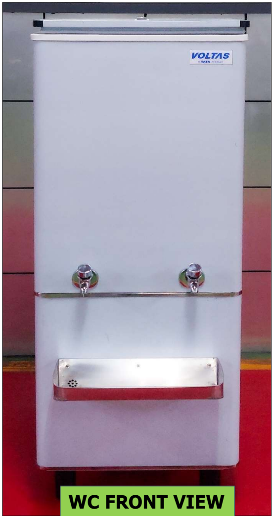
WC FRONT VIEW