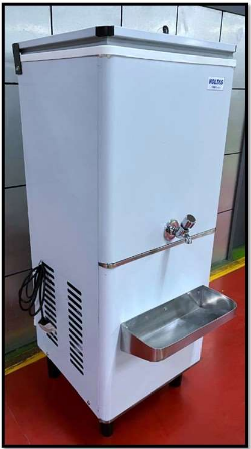
Front FS 30 /40