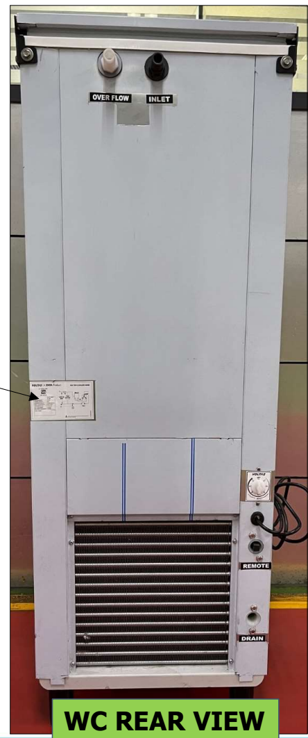
WC REAR VIEW