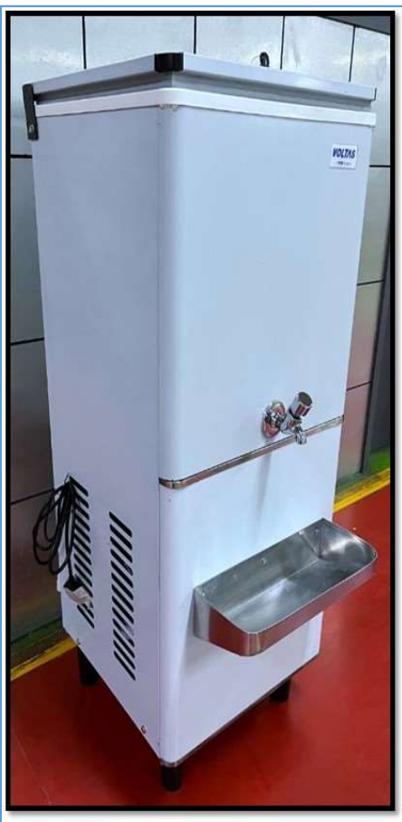
Front FS 15 /40