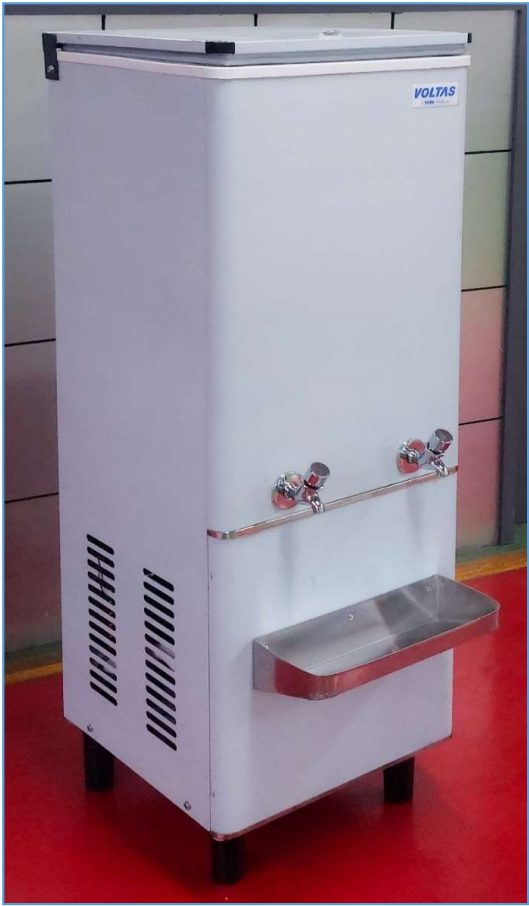
Front FS 40/80