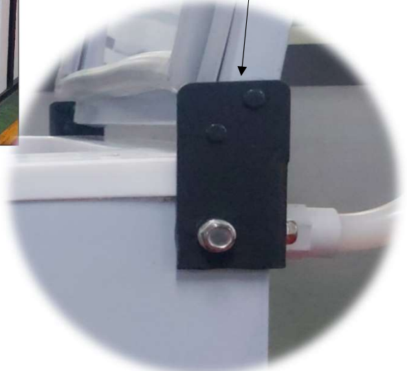
HINGE IN TOP PANEL ASSLY