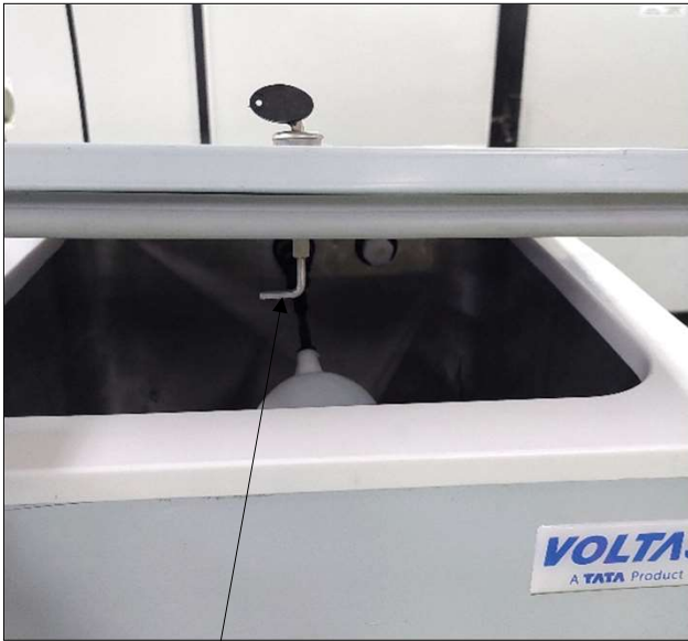
LOCK PROVISION IN TOP PANEL