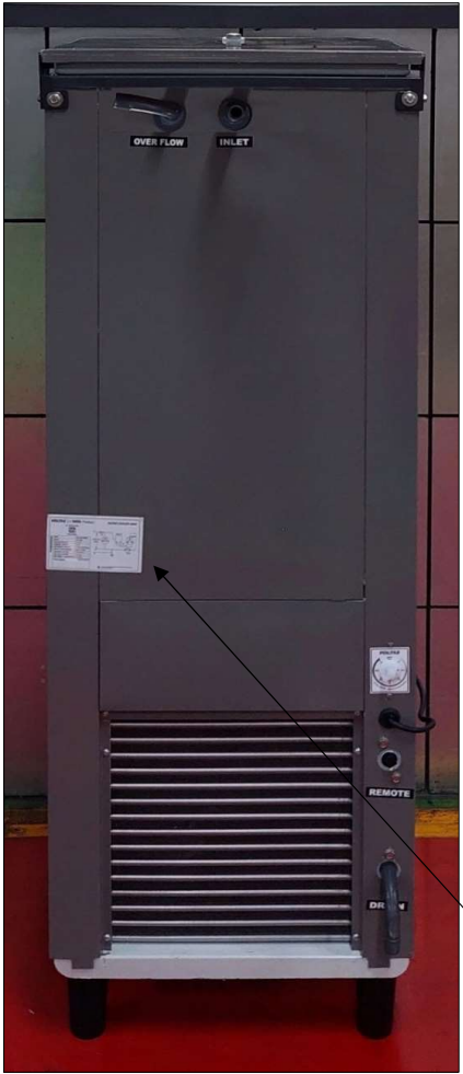
WC REAR VIEW