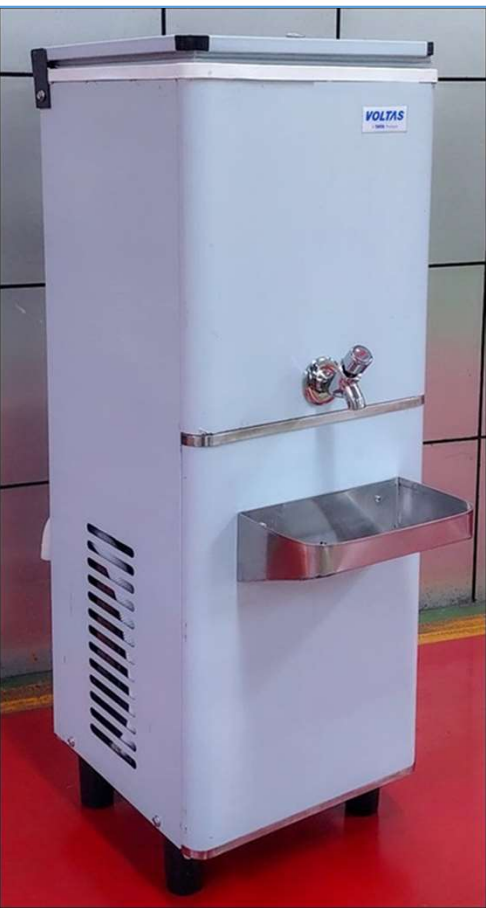
Front FS 15/20